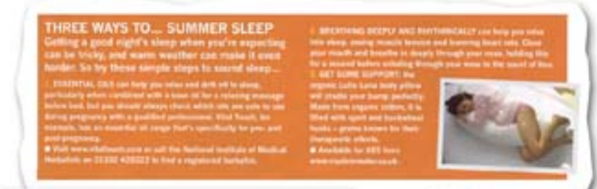
Pregnancy, Baby & You, July 2006